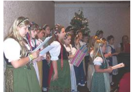
The New Braunfels Kinder Choir, in full costume, delighted everyone with their joyous singing!

ment was the joyous singing of traditional Christmas songs in German by the New Braunfels Kinder Choir. However, a crowd favorite was their German rendition of "Rudolph the Red Nosed Reindeer!" Donations to the SOS Food Bank were also rounded-up during the evening and delivered the next day as a way for the Club to "Serve" during the season of giving.