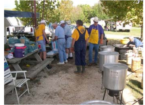
Lions cooking at the Dam Red Barn "Shrimpfest"